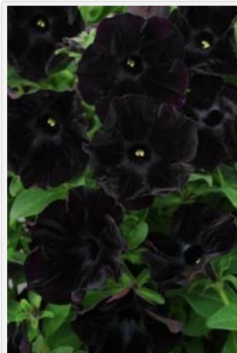
Black Velvet petunia from Simply Beautiful.