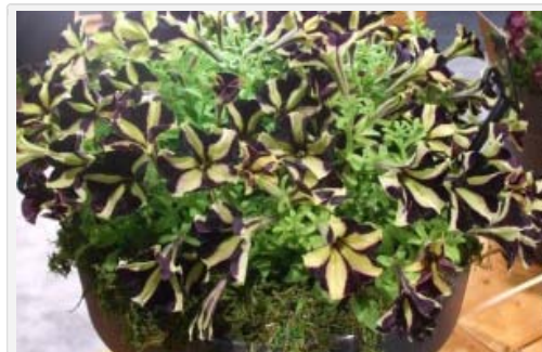
Phantom petunia from Simply Beautiful.

There were other interesting plants, too, including many tropical foliage plants, which continue to remain popular with high-end gardeners and plant geeks. I'll write about some of the tropicals a little later. Meantime, it was the petunias that got cameras clicking.